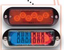
TIR6 & LIN6