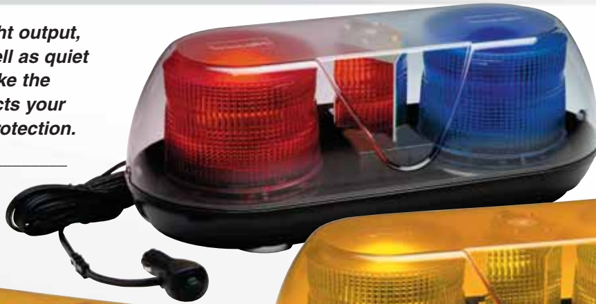
G7MCRB Magnetic Mount

Sleek styling, superior light output, universal mounting, as well as quiet and reliable operation make the Guardian Series of products your first choice for warning protection.