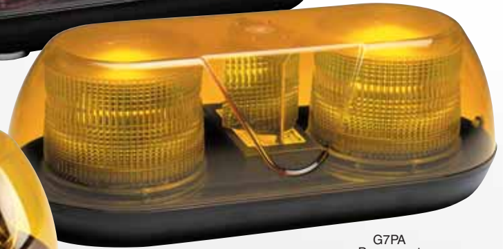
G7PA Permanent Mount

The Guardian Series is available in permanent, magnetic or magnetic/suction mount variations to meet your every need.