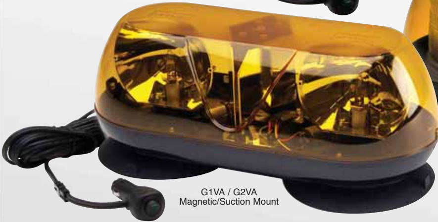
G1VA / G2VA Magnetic/Suction Mount